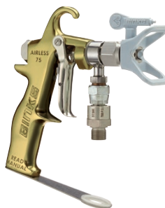
Airless 75M Direct Connect

Hose connects directly to gun to reduce weight.