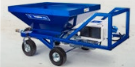
ROTOR STATOR PUMP

The simple technology of a rotor stator pump is perfect for contractors who are looking for a basic pump that is easy to clean and service. The P30X has a large 60-gallon (227 L) hopper and offers superior performance from a rotor stator pump.