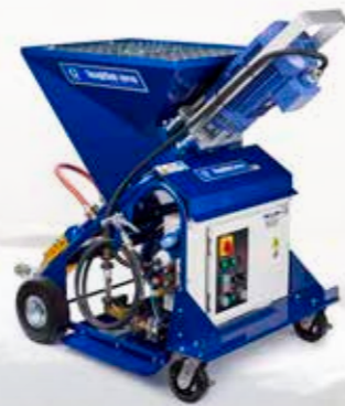
ROTOR STATOR PUMP

Although identical in size and function as the MP20, the MP40 has double the output and can pump up to 200 bags per hour of self-leveling underlayment. The larger motor and pump make the MP40 an excellent fit for contractors looking for a high production solution.