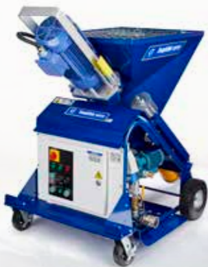
ROTOR STATOR PUMP

With its ability to mix and pump, this all-in-one compact machine is the ideal solution for contractors looking to make the switch from manually applying self-leveling underlayment. The MP20 can deliver up to 100 bags per hour allowing contractors to get jobs done faster.