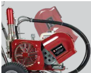
Belt Guard Easy access for converting from electric to gas power.