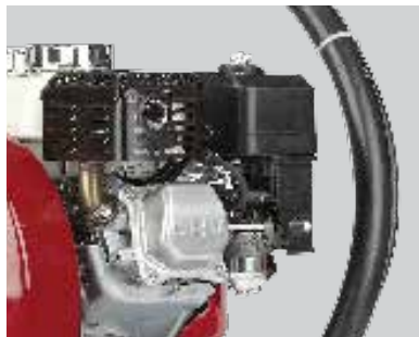
Convert from Gas to Electric Power Easily convert from Electric to Gas power. No tools required.

These high-performance, heavy-duty paint sprayers use long-stroke, slow-cycling hydraulic piston technology for economical operation and dependable, long-term spraying.