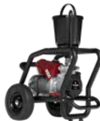
Low Rider with hopper accessory (hopper sold separately)