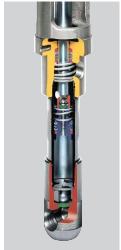
Severe Service™ 900 Pump Cylinder and piston rod are tempered with a proprietary heat-treating process that increases pump life 150% over competitive pumps. Self-adjusting packings resist over-tightening and help prevent premature wear.