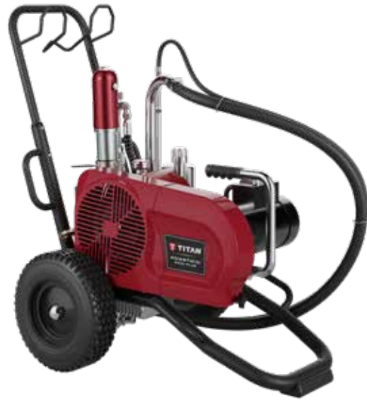
PowrTwin 6900 Plus 3" Stroke

The PowrTwin 6900 Plus comes with S-3 Gun, 517 TR 1 Reversible Tip and 1/4" x 50' Airless Hose.