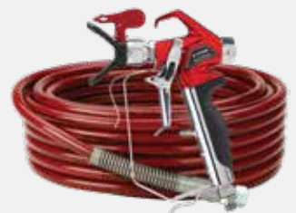
The Impact 640 comes with RX-Pro Gun, 517 TR Reversible Tip and 1/4" x 50' Airless Hose.