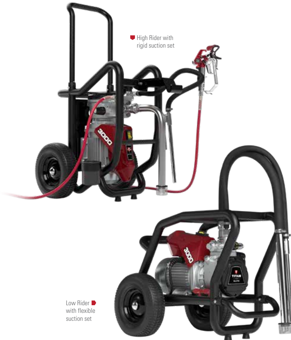
High Rider with rigid suction set