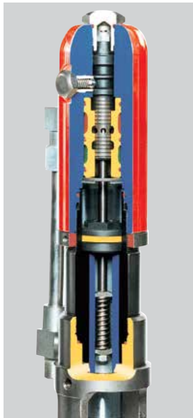
Speeflo® HydraDrive™ Smooth, slow-stroking hydraulic drive provides extreme power and reliability.