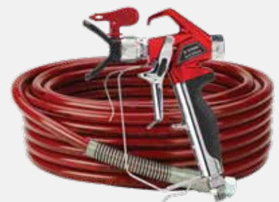
The Elite 3000 comes with RX-Pro Gun, 517 TR1 Reversible Tip and 1/4" x 50' Airless Hose.