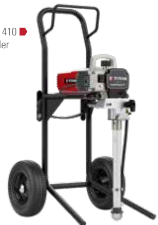
Impact® 410 High Rider