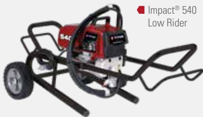
Impact® 540 Low Rider