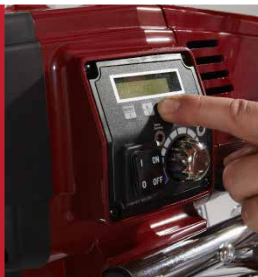
Impact® 640 Low Rider