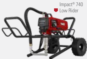
Impact® 740 Low Rider

The Impact 740 is designed for extended, heavy-duty performance on larger residential and commercial projects. This is the sprayer contractors turn to when the time comes to enter the big leagues.