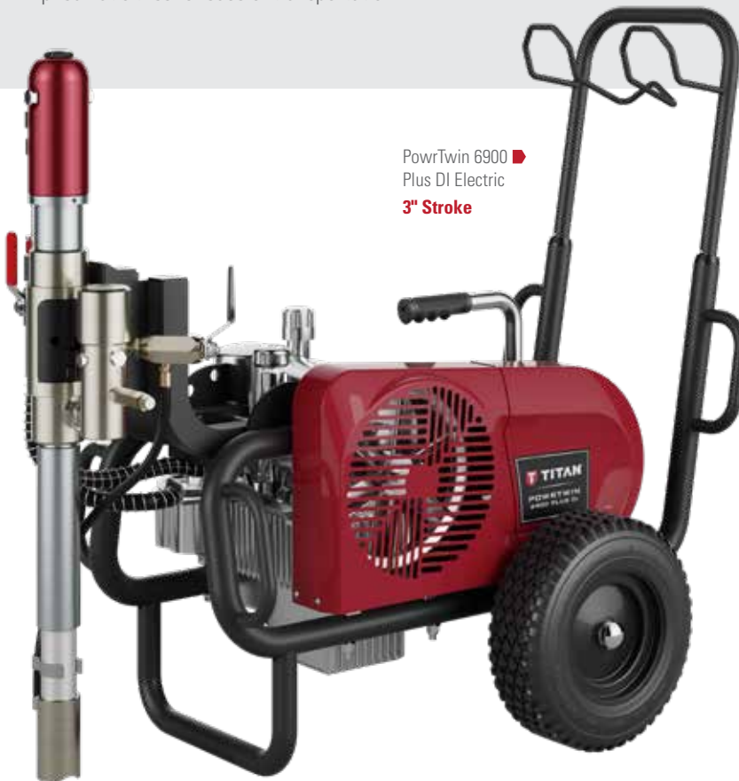
PowrTwin 6900 Plus DI Electric 3" Stroke