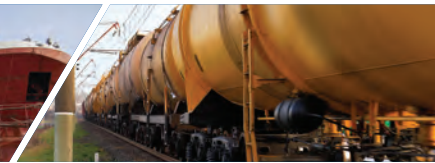
LARGE VEHICLES, TRAILERS, RAILCARS AND CHASSIS MANUFACTURERS