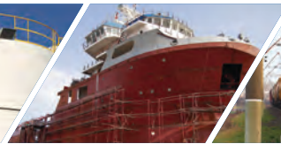
MARINE AND SHIP BUILDING