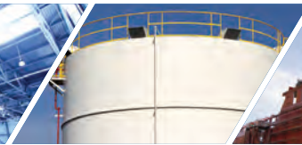
PIPE AND STORAGE TANKS