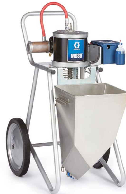
ToughTek M680a CS

The ToughTek M680a piston pump handles abrasive materials such as epoxy mortars, non-skid coatings (bridges and marine industry – solvent based coatings) or cementitious materials, and tackles difficult polymers with fillers such as glass flake, silica or sand. The all stainless design makes cleanup of epoxy mortars easy and worry-free.